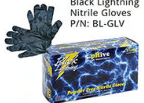
Black Lightning Nitrile Gloves P/N: BL-GLV