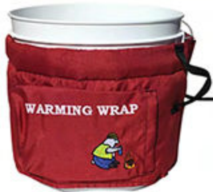
2 Gallon Pail Warmer Temp 105° F P/N: 0609-PLW2