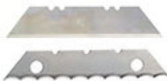
P/N: UB-4NOTCH (10 Blades) P/N: UB-SB10 (10 Blades)