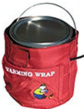
1 Gallon Pail Warmer Temp 105° F P/N: 0609-CNW

Available in 1, 2, and 5 gallon sizes Power: 120V AC