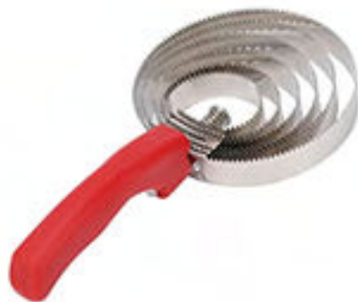
Curry Comb Overspray Removal Tool P/N: STEELCURRYCOMB