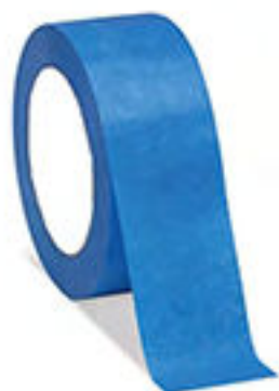
3M Tape 2" x 60 Yard Roll P/N: 3MPAINTTAPE