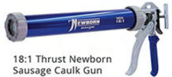
18:1 Thrust Newborn Sausage Caulk Gun P/N: 620AL