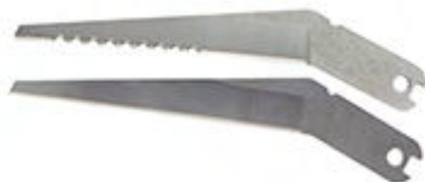
P/N: RKB-472 (Serrated Edge) P/N: RKB-471 (Straight Edge)