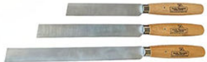
Arctic Warmers Mineral Wool Knives 6" Length P/N: MWK6-AW 8" Length P/N: MWK8-AW 10" Length P/N: MWK10-AW