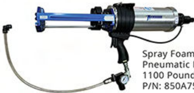
Spray Foam Pneumatic Dispenser 1100 Pounds @ 100 PSI P/N: 850A75