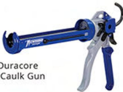
Newborn Duracore 18:1 Tube Caulk Gun P/N: 250