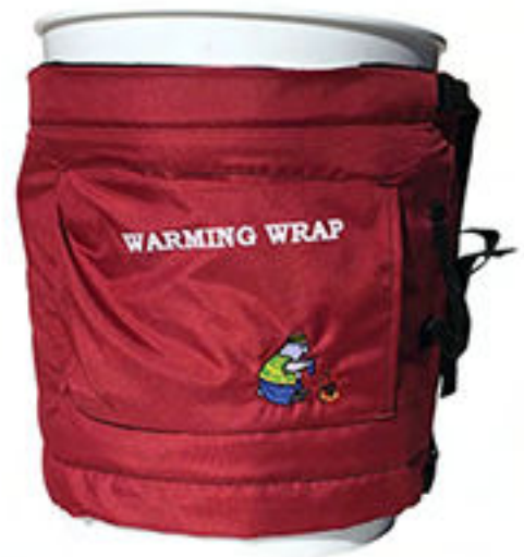
5 Gallon Pail Warmer Temp 115° F P/N: 0609-PLW5