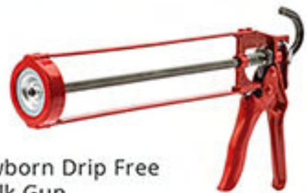
Newborn Drip Free Caulk Gun P/N: 115D